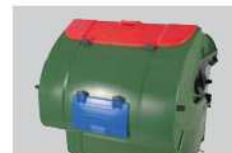
lid within a lid