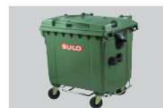
lid opening device