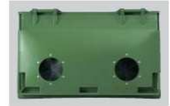
200 mm with rubber rosette