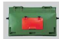
lid within a lid