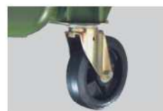
elastic-solid rubber tyres