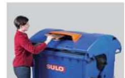
paper hood on top