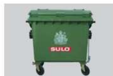
mould on graphics