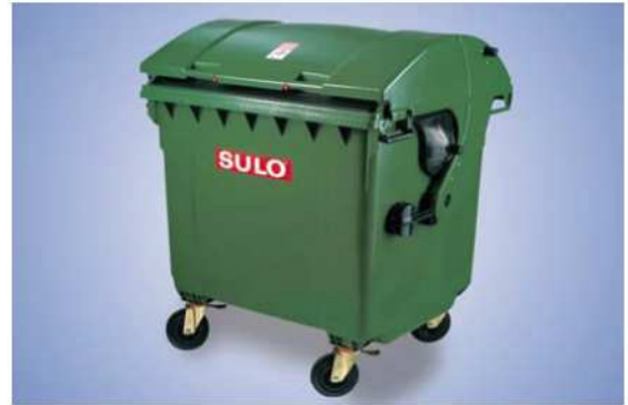
MGB 1100 dome lidded with child safety device