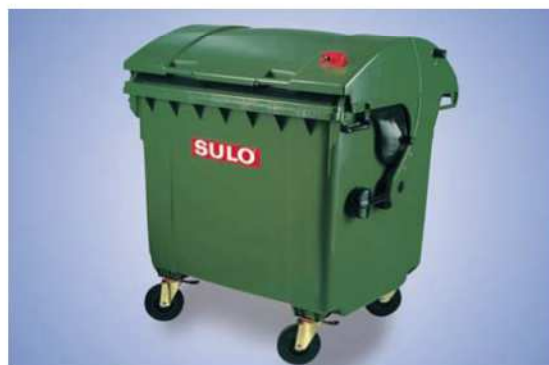
MGB 1100 dome lidded automatic lock

EQUIPMENT SUPPLIES TO: CONSTRUCTION - CIVIL ENGINEERING - PLANT HIRE - LOCAL AUTHORITIES - GOVERNMENT BODIES