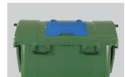
lid within a lid