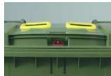
automatic lock 2300/2303