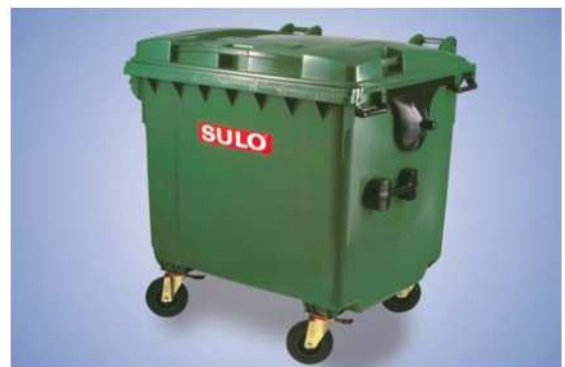
MGB 1100 flat lidded