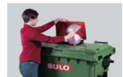
lid within a lid