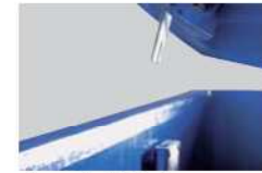
triangular lid lock