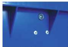
triangular lid lock