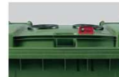
automatic lock 2303