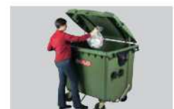
lid opening device