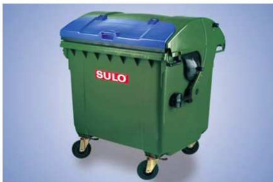
MGB 1100 dome lidded lid within a lid