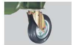
steel rim, ball bearing