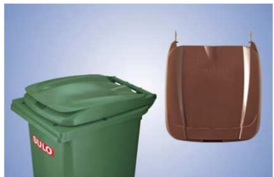
EURO 2 lid (optional)