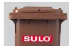
triangular lid lock