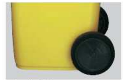
wheels 250 mm