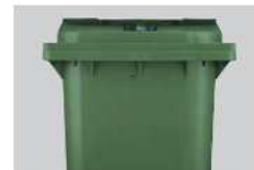
triangular lid lock