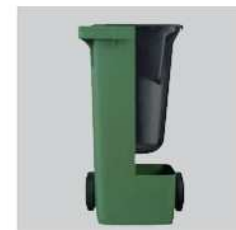
50 litres round insert