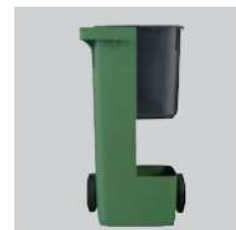
60 litres square insert