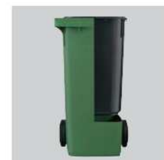
80 litres square insert