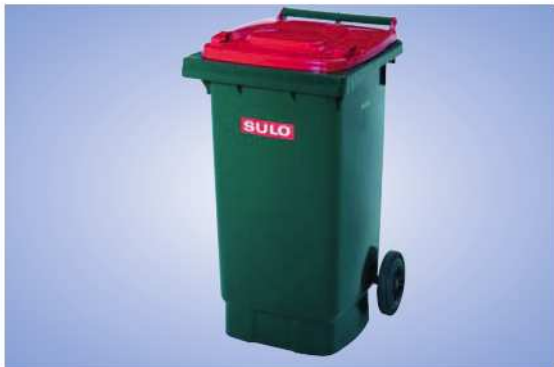
MGB 140 Kompakt