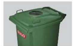
aperture for recycling 200 mm