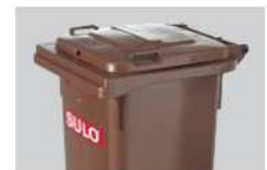
triangular lid lock