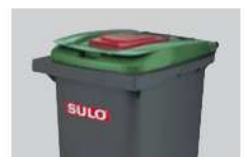
lid within a lid