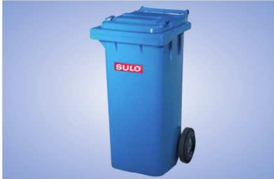
MGB 80 Kompakt

SULO accessories are proven through their superior quality and attention to detail. With a choice of five basic models, and so many accessories you are sure to find a container that meets your individual requirements.