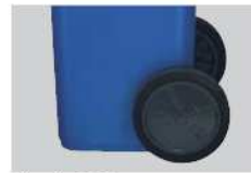
wheels 250 mm