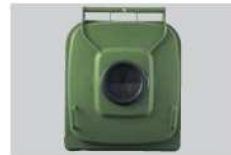
aperture for recycling 150 mm