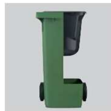
40 litres round insert