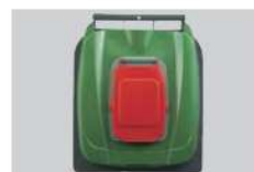
lid within a lid