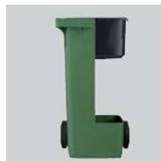
35 litres square insert