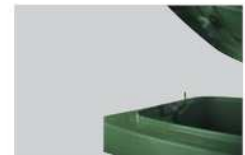
triangular lid lock