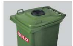
aperture for recycling 150 mm