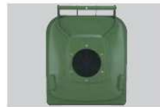
aperture for recycling 200 mm